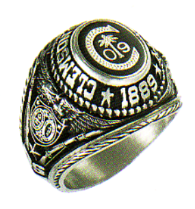
Men's Large Thite Gold, Antique Finish 1500X