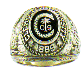
Men's Large White Gold, Natural Finish 1500X