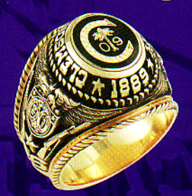
Men's Super Large Yellow Gold, Antique Finish 1500SX