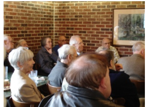
Attendance at the last No Power Point Seminar prompted a move to a larger location. Join us at the New China Buffet on April 17.

Make your check payable to Clemson University Foundation, and in the memo line write "Emeritus College." Mail your check to the Emeritus College Office, E 304 Martin Hall, Clemson University, Clemson, SC 29634. You may also pay by credit card by downloading the form available on our web site and following the instructions provided. Just click on Who We Are in the column on the left on our Homepage and then Friends of the Emeritus College. All contributions are credited toward your giving record at Clemson. AND you will receive a pocket size magnifier in a plastic cover that's perfect for a wallet or handbag!