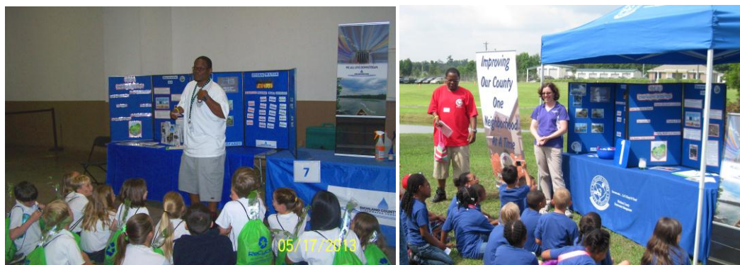
Students answer questions about water quality at the Stormwater booth at Richland Recycle Day (Left) and National Public Works Week Kids Day (Right).

On May 17, Richland County residents recycled over 225,000 pounds of materials, including electronics, tires, refrigerators, household hazardous wastes, paper and other hard to recycle items. The turnout was huge, with over 1,338 cars came through the collection site. In addition, 350 fifth grade students participated in learning activities related to recycling, preventing pollution, and taking care of the earth. It was a fun and productive day for all. Please join us again next year, and in the meantime, go to www.richlandonline.com for information on recycling in Richland County throughout the year.