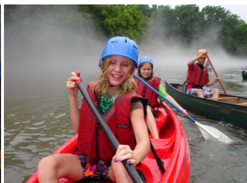
Left, campers use a seine net to study the fish of Lake Murray. Right, students take a trip down the Saluda River.