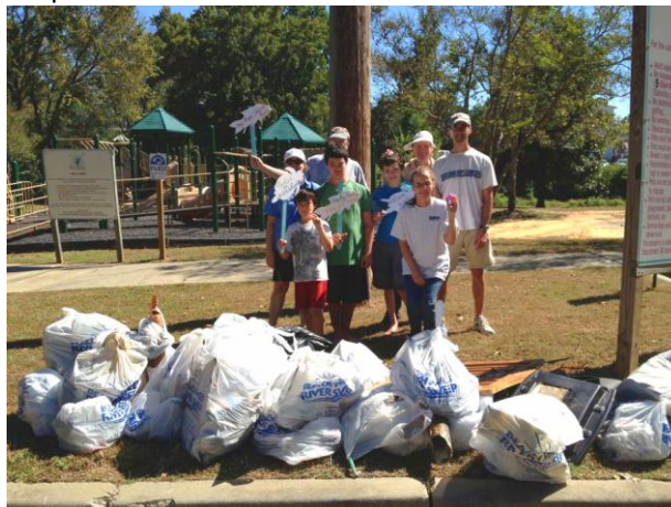
Volunteers at Olympia Park.

Thank you, volunteers, for making an impact with River Sweep! On September 21, volunteers with Keep the Midlands Beautiful picked up over 30 bags of trash from the banks of the Saluda River near Riverbanks Zoo. On Sept. 22, volunteers from the Rocky Branch Watershed Association also got into the action and cleaned up trash at Olympia Park. Both events were part of the annual Beach Sweep/River Sweep statewide cleanup effort, sponsored by the SC Department of Natural Resources and SC Sea Grant.