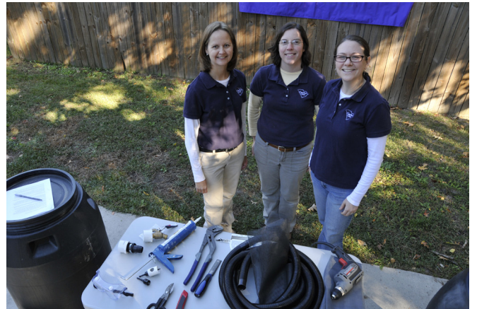
Preparing to film the Build Your Own Rain Barrel video