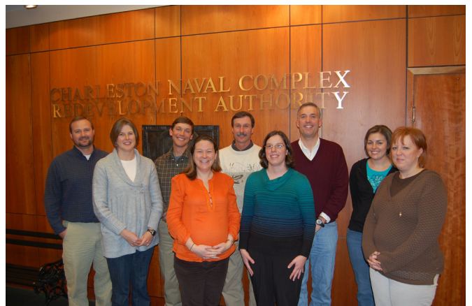
Carolina Clear Team in January 2010