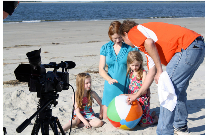
Filming final scene of 2011 media campaign