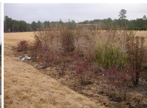
Left: Volunteers from St. Francis Xavier High School and Sumter Master Gardeners plant shrubs by the pond. Right: The red leaves of Virginia sweetspire add fall color to the rain garden.