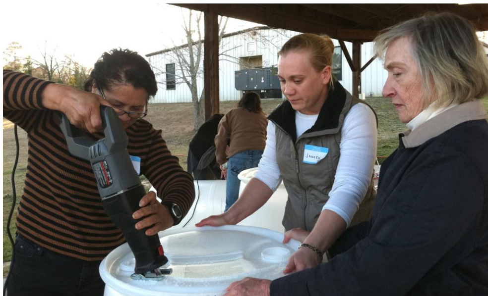
Making a rain barrel from a recycled Coca-Cola syrup drum.

Thirteen Sumter homeowners will have a lot more water for their gardens this spring. On March 7 th , Sumter Stormwater Solutions held a rain barrel workshop where participants made their own rain barrels for their homes. Rain barrels capture rain water from roofs. This water can be used to water lawns and gardens, wash cars, and other outdoor uses. Want to build a rain barrel but missed the workshop? Download Rainwater Harvesting for Homeowners from the Carolina Clear website.