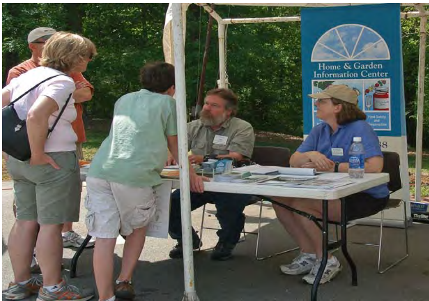
HGIC Staff working at SCBG Garden Fest 2010