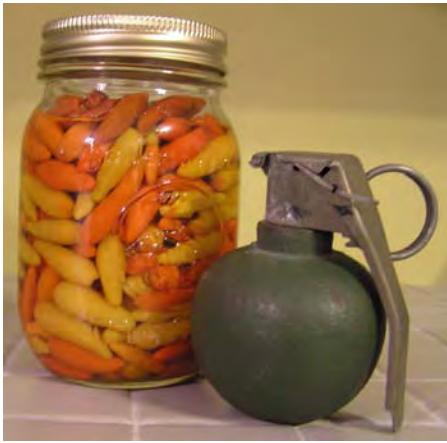
Home Canned Food & Grenade