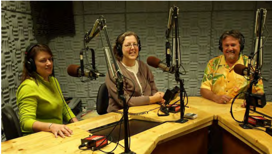
HGIC Staff at the Your Day Radio Studio