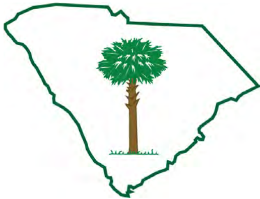
South Carolina Landscape & Turfgrass Association