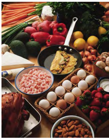
Healthy Food Choices

With renewed interest in growing local foods, comes increased interest in preserving foods at home. The HGIC provides up-to-date information on how to safely preserve foods by canning, drying and freezing. The hot topic article Can Foods Safely Avoid “Can Grenades!” was written in response to numerous calls from consumers who stored food in jars without knowing how to process it safely. Fact sheets for preserving fruit were updated and provided to farmers markets for local distribution.