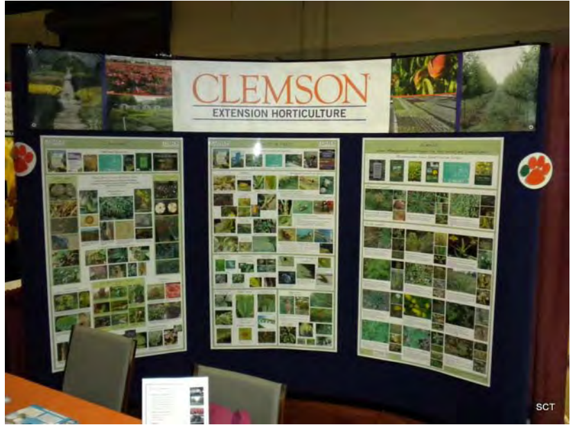
Clemson Extension Horticulture Trade Show Booth

The HGIC received 22,218 calls through our toll-free lines. 13,430 calls came through between the hours of 9 AM and 1 PM. Of those, approximately 6,500 calls were answered by a horticulture or food safety specialist.