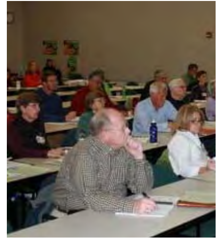
Master Gardener Students

At the end of a year, the Pickens and Oconee County Master Gardeners participated in hands-on training where they had the opportunity to put their knowledge to work by identifying various plant samples and solving consumer horticulture problems.