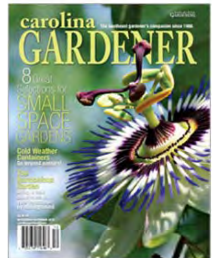
Carolina Gardener Magazine Cover

An HGIC staff member served as the Midland Regional Reporter for Carolina Gardener magazine. Monthly reports feature things to do for the lawn, trees, shrubs, flowers and vegetable garden. Carolina Gardener magazine is written by and for Carolina gardeners. Over the years the Carolina Gardener magazine readership has expanded across the Southeast.