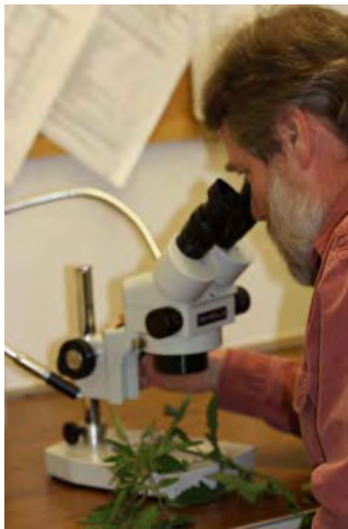
Extension Agent Examining Plant Problem