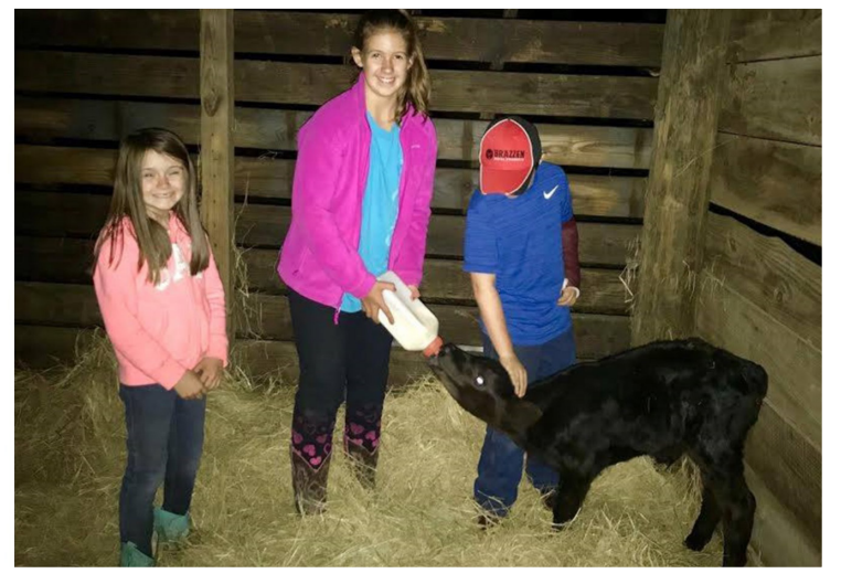
Members of the 4-H Palmetto All Stock Club are working hard with their project calf.