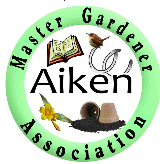
▲ Aiken Master Gardener Association

52 Aiken County Master Gardeners drove 18,059 miles to deliver more than 3,539 hours of educational, research-based horticulture programs to 3,400 people. Master Gardeners in Aiken provide services and programs unique to Aiken County:o 7 certified MGs provided horticultural advice to 190 home gardeners via the in-office Master Gardener Help Desk.o Aiken MGs provided horticultural information to 373 market patrons via a Meet-a-Master Gardener booth at the Aiken County Farmers Market.o AMGA's free Lunch Box Series lectures had over 593 attendees in 2017.0 The AMGA Speakers Bureau accommodated 26 Speakers Bureau requests and spoke to 562 people.o Proceeds from the 20 fee-based Rent-a-Master Gardener visits made in 2017 helped fund 6 scholarships totaling $4,500 for 4 high school and 2 college students from Aiken County.o Aiken Master Gardeners design, install, and/ or maintain a number of plantings and gardens around the County. -AMGA Display Garden-Silver Bluff Audubon Center and Sanctuary Butterfly Garden-Aiken Railroad Depot-Dollhouse Garden-Claudia Lea Phelps Memorial Garden-Brothers and Sisters of Aiken County garden-Various church and school gardens around the County