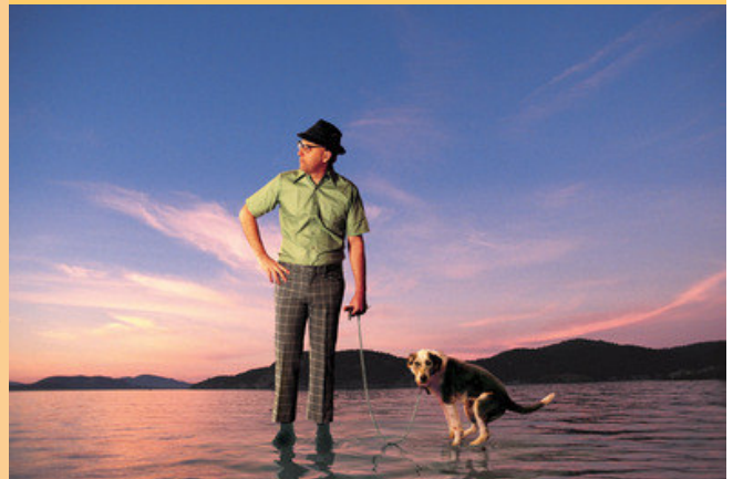
Photo design by the Washington State Dept of Ecology, King County, and the cities of Bellevue, Seattle and Tacoma