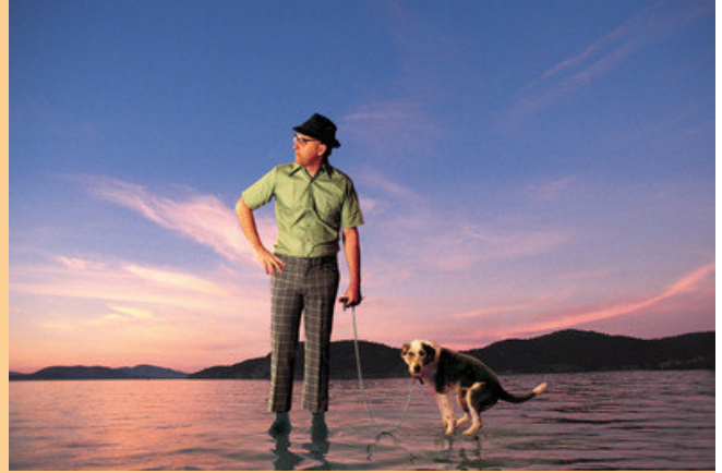
Photo design by the Washington State Dept of Ecology, King County, and the cities of Bellevue, Seattle and Tacoma