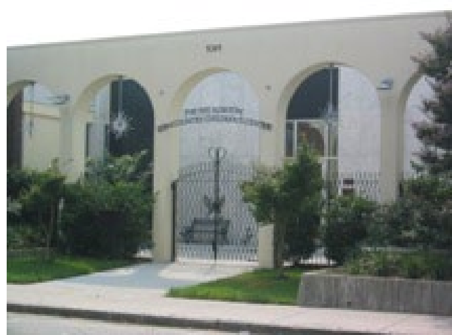
Dee Norton Center