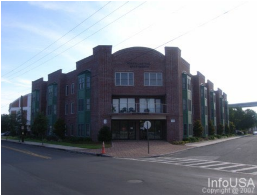
North Central Apartments [senior home]