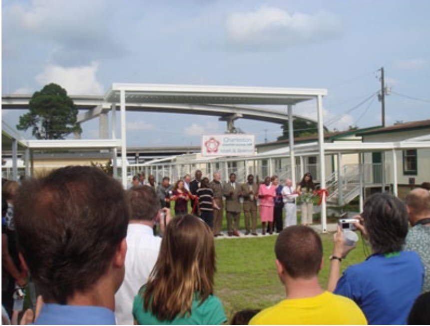
Charleston Charter School of Math and Science