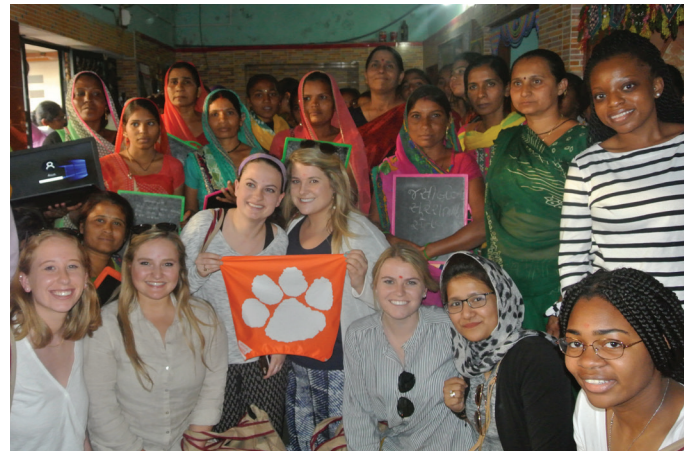
▶ STUDENTS VISIT WITH LOCAL WOMEN IN AN ADULT LITERACY WORKSHOP IN A REMOTE VILLAGE TWO HOURS FROM AHMEDABAD, INDIA.

The Women's Leadership program is intent on supporting students, especially those who might be from underrepresented groups, by providing scholarships, study-abroad opportunities, nationally-recognized speakers, and student travel to conferences. The program is committed to raising awareness about issues that impact women and creating opportunities for young women with leadership potential and the will to make a difference in their communities.