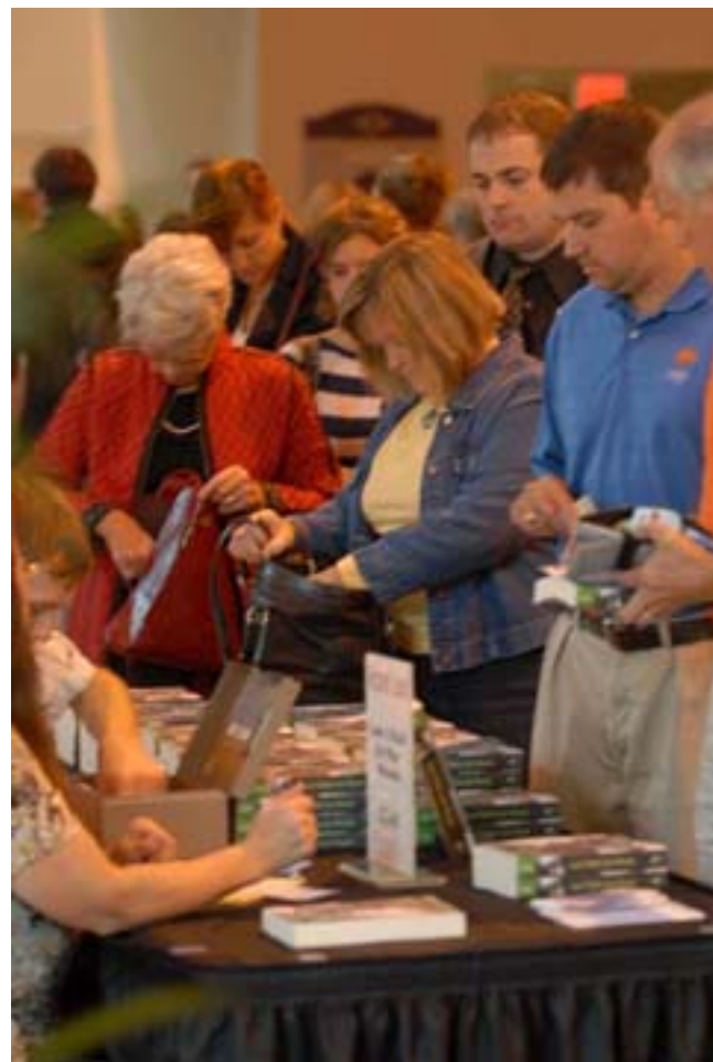
Lecture attendees line up to purchase Richard Louv's book

for Social Policy and Management at Brandeis University. He has appeared on Good Morning America, the Today Show, NPR's Fresh Air and Talk of the Nation, and most recently, the CBS Evening News and the NBC Nightly News.