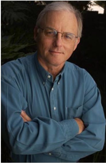
Richard Louv, author and Chairman of the Children & Nature Network