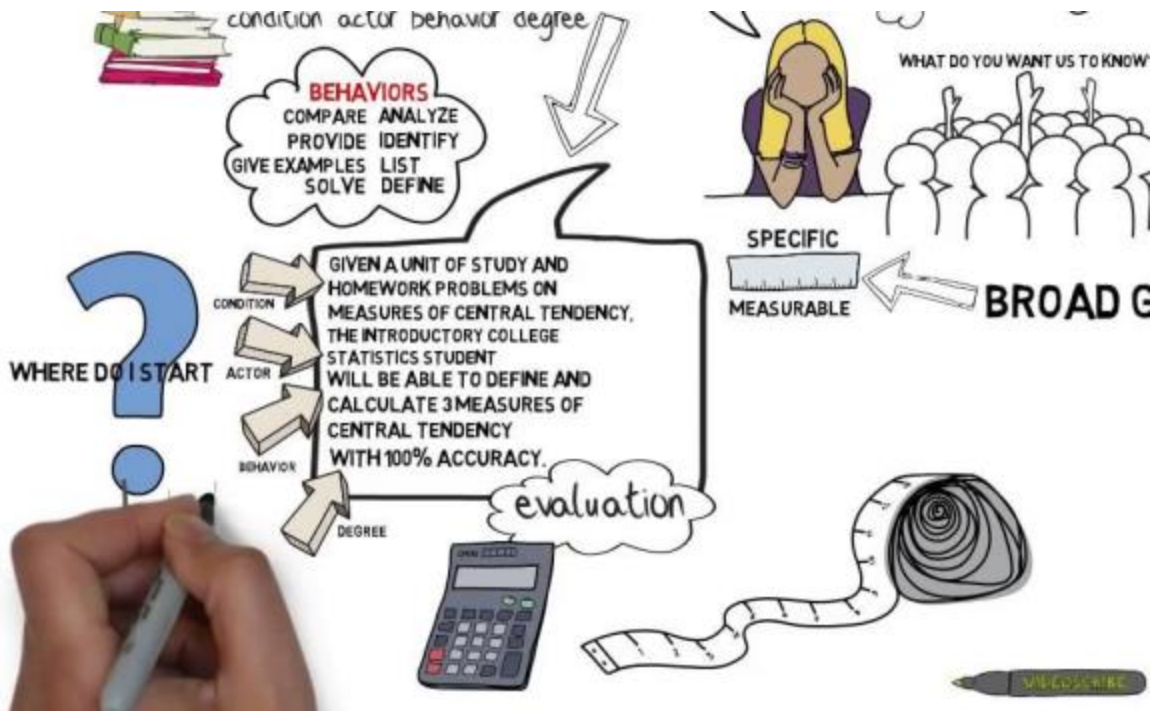
Image above links to a youtube video at: https://www.youtube.com/watch?v=eXxTpDg1thI&feature=youtu.be

4 - How are learning outcomes written and measured?