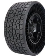
Michelin X Tweel Turf Tire (Golf) For golf carts and utility carts.