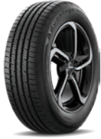
BF Goodrich Advantage Control Tire All-season tire for sedans and CUVs.