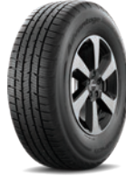
BF Goodrich Advantage Control HT Tire All-season tire for SUVs and light-duty pickup trucks.