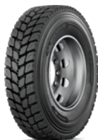
Michelin X Works D Tire Drive axle tire for construction/dump trucks.