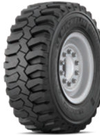
Michelin BibSteel Hard Surface Tire Ideal for hard surfaces.