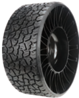
Michelin X Tweel Turf Tire For zero-turn radius mowers.