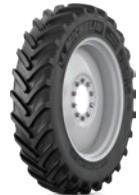
Michelin YieldBib Tire For tractors and other farm equipment.