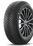
Michelin CrossClimate 2 Tire Premium all-weather tire.