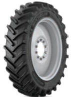
Michelin AgriBib 2 Tire For tractors and other farm equipment.