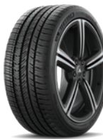
Michelin Pilot Sport A/S 4 Tire Optional for high-performance units, this tire offers excellent grip and braking for emergency response.

Copyright © 2026 Michelin North America Inc. All rights reserved. The Michelin Man is a registered trademark owned by Michelin. Photography © Clemson University.