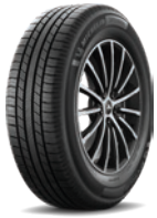
Michelin Defender 2 Tire Long-lasting all-season tire.