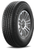
Michelin Defender LTX M/S 2 Tire Long-lasting all-season tire for SUVs and light-duty pickup trucks.