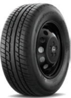
BFGoodrich Elite Force - Police Pursuit Tire Engineered for high-speed pursuit performance, and excellent tracking, braking and durability.