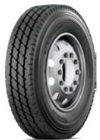
Michelin X Works Z Tire On/off-road steer tire.