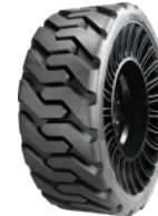
Michelin X Tweel SSL 2 Tire For skid steer loaders.