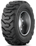
Michelin BibSteel A/T Tire Durable tire for a variety of surfaces.