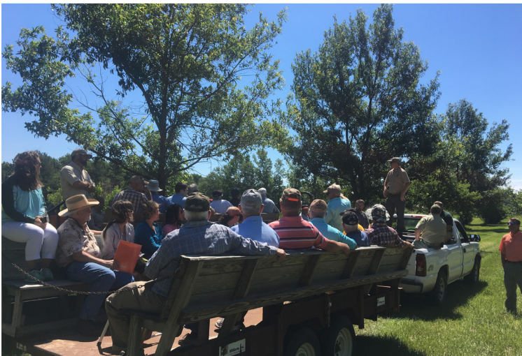
▲ Local forest landowners learn best practices from Clemson experts.