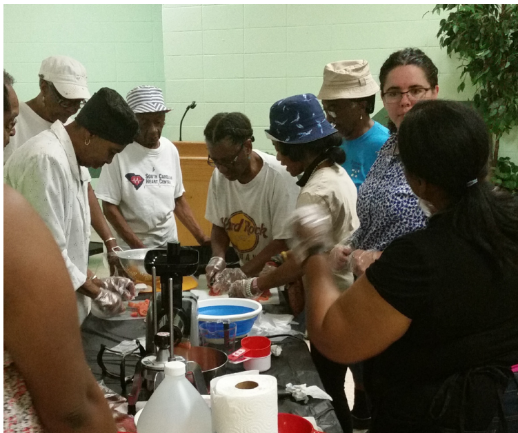
▲ Allendale citizens work together to make salsa.