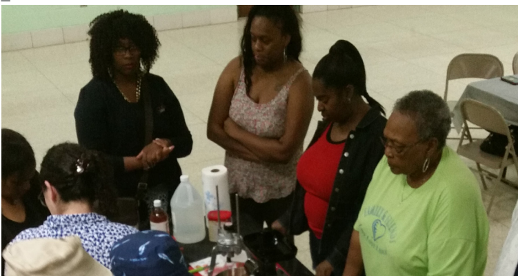
◀ Clemson Extension offers a variety of hands-on programs to the community.

Clemson Extension continues to deliver forestry programs through the Salkehatchie Forestry Association. This active organization is an affiliate member of the S.C. Forestry Association and offers many educational opportunities to clients interested in forestry. The Salkehatchie Forestry Association held two meetings on the following topics: the new Holly Hill Woodchip Mill Facility and the recent discovery of Emerald Ash Borer in SC. Average attendance for these meetings was 25 landowners and forestry professionals. Clemson Extension also supports the citizens of Allendale County by use of an Area Extension Forestry & Natural Resources Agent who provides advice on forest management and wildlife management through habitat modifications and food plots. This agent also aids with forestry related issues including disease and insect identification, pond issues and urban tree questions.