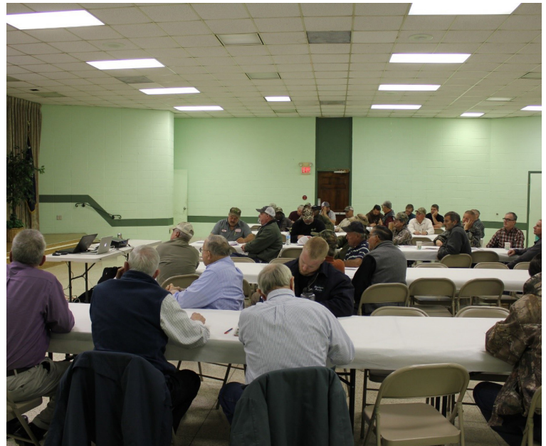
▲ Peanut farmers learn best practices from Clemson Extension staff.