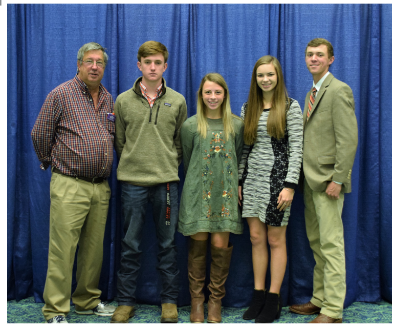
▲ The National 4-H Livestock Judging Contest was held November 13-15, 2017 at the North American International Livestock Exposition (NAILE) in Louisville, Kentucky