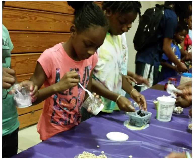
▲ Youths learning how to make a breakfast parfait