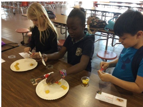
▲ Students learning how to make Blubber Burgers

A one day Gardening presentation was conducted for Blackville Girl Scout Troop. Students participated in the “Mystery Seed Game” They learned about fruits and vegetables that can be grown in a home garden and the benefit of eating fruits and vegetables.