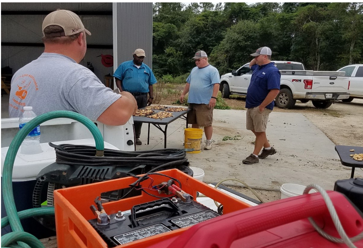
▲ On-Farm Workshop at Nix Farms