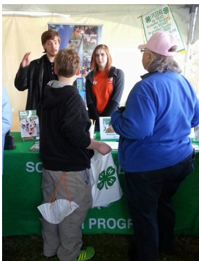
Charleston STEM Festival

Last but not least, 4-H and the Natural Resources Extension Team worked together to host a 4-H2O water exploration camp during the summer. Over 40 youth attended the camps and were exposed to 4-H as well as the natural world around them, with emphasis on stewardship of our shared water resources.