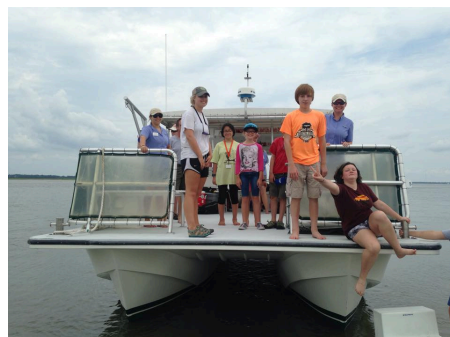
4-H2O Summer Camp