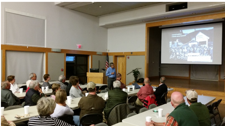
Photo: Fall Forestry Association Meeting discussing impacts of forestry industry on the local economy.