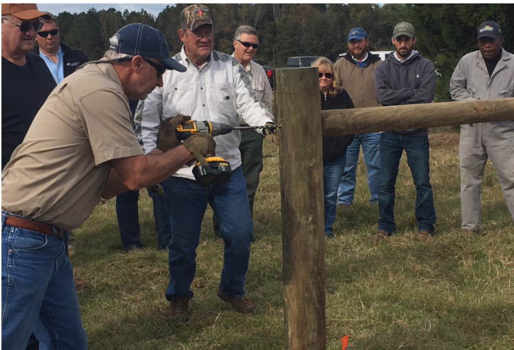
▲ Fence Construction Demonstration