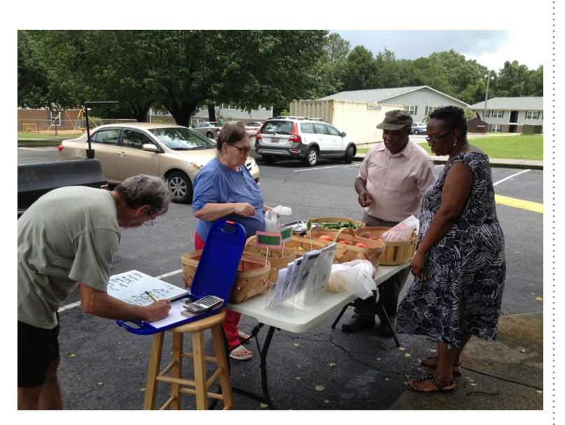
A Residents visit the mobile market to purchase fresh fruit and vegetables.

The goal for the two Mobile Farmers Markets is to increase the accessibility of fresh fruits and vegetables to underserved communities and provide economic growth for our participating local farmers. The Colleton Mobile Market is offered on Wednesdays for 8 weeks during the summer at 7 of our subsidized housing complexes. Each week between 50 and 75 families visit the Mobile Market; we enjoy talking with children as they purchase fruits and vegetables. We accept SNAP and hand out healthy recipes and nutrition information to anyone visiting the mobile market. In addition to our Mobile Market, we offer a CSA (Community Supported Agriculture) style market to African American Churches. Families pay $5 each week and we delivered the vegetables and fruits to the participating churches where the families pick up their basket of vegetables. The CSA market is offered in June and July at 7 locations and reaches 88 families weekly. Master Gardener volunteers and members of Eat Smart Move More Colleton County assist weekly with selling at the Mobile Market and preparing our CSA vegetable bags.