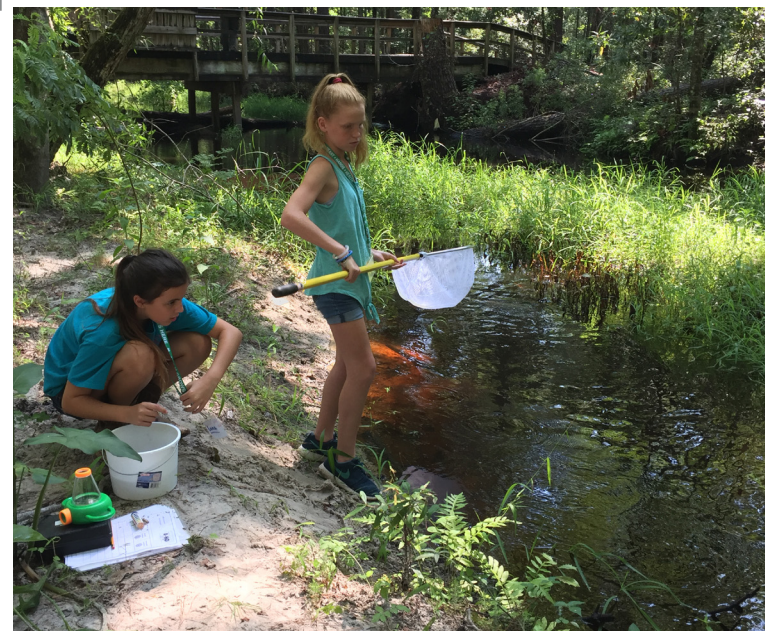
▲ Youth studied flora and fauna native to the Walterboro Wildlife Sanctuary during "Water in the 'Boro" 4-H summer camp.