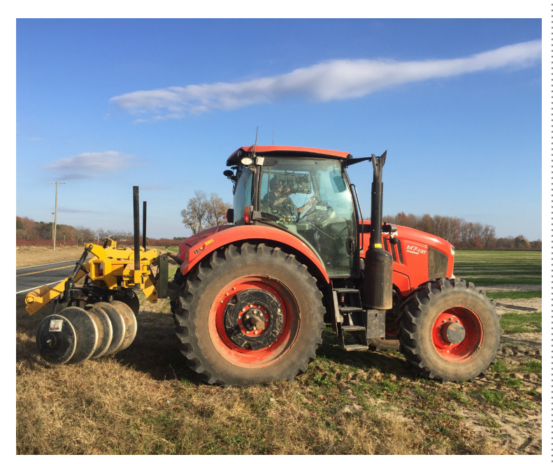
Bedding Plow purchased through a grant to address early tree decline by soil borne pathogens