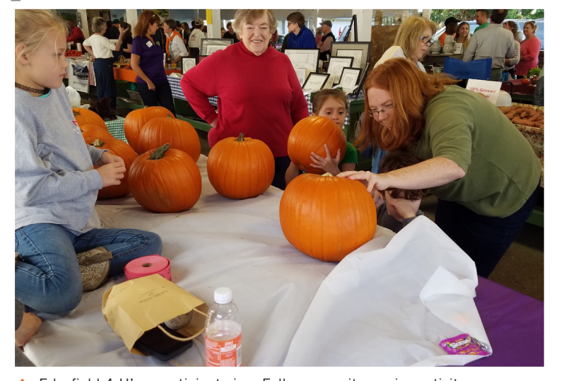
Edgefield 4-H'ers participate in a Fall community service activity