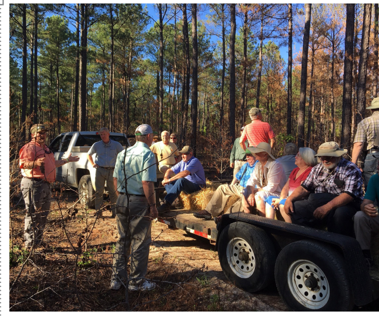
▲ Forestry Association Members learn about prescribed fire benefits.

Ride through the county and you will see strips of green cover crops growing between where peaches will be planted. After three years of demo, educational meetings, and one on one discussions with growers, conservation efforts are beginning early in the re-establishment phase of orchard renewal. According to recent estimations, soil loss may be reduced by as much as 78% just by establishing cover early. While row middles have always been planted, it has not been until after trees are planted in late December through January. This reduces the effectiveness of the cover early, results in lower biomass, and allows erosion patterns to be developed. Our message has been that "you have one shot to do it right, or you live with the results throughout the life of the orchard". The bedding plow pictured was obtained via a grant to address early tree decline by soil borne pathogens. Its light draft and less aggressive action causes minimal disturbance to the established cover and eliminates several field operations compared to the heavier equipment modified for prior use.