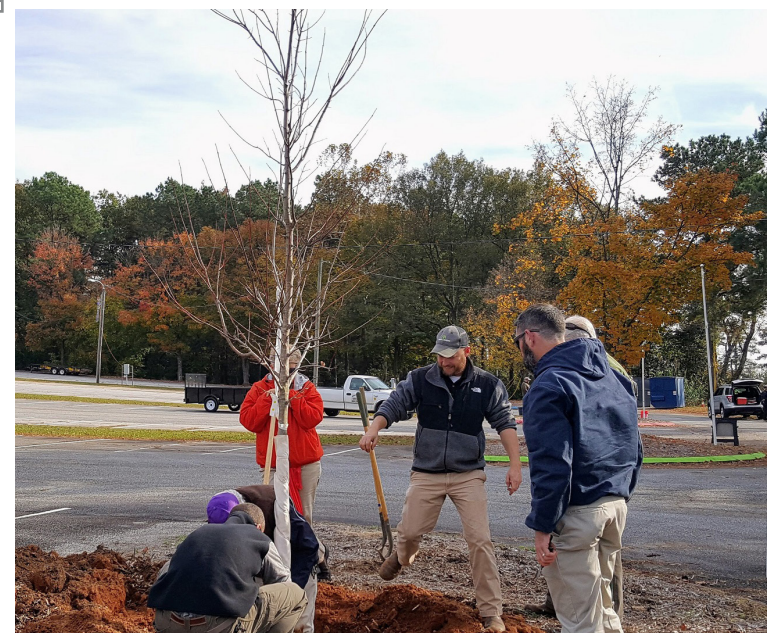
Community Tree Keepers participants learn how to properly plant a B&B red maple.