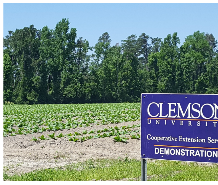
▲ Bacterial Wilt Tobacco Variety Trial in Horry County