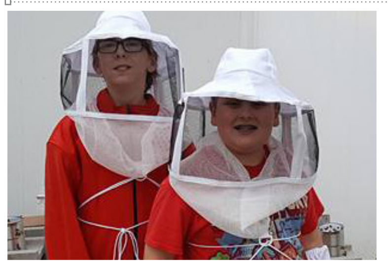
Junior Blackwater Beekeepers Honey Bee Project Participants