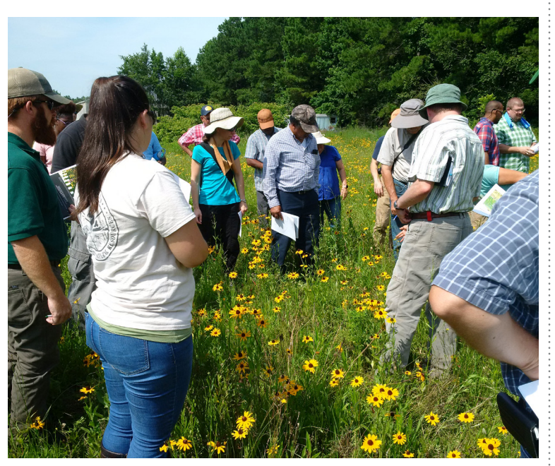
Workshop participants evaluate a field of first-season monarch butterfly habitat at Pig Creek Farm, Bishopville, SC.

Pollinators and other beneficial insects have suffered significant population declines in recent years, partly due to habitat loss. Because these insects play essential roles in natural communities as well as in food production, it is important to educate the public about conservation practices and precautions that improve habitat conditions. Clemson University has partnered with USDA-NRCS to establish plots of native wildflowers and grasses that support these insects. Plots are located at Lee State Park and on a private farm in Bishopville, as well as Clemson's Sandhill Research and Education Center in Columbia. Several workshops have already been conducted at these sites for private landowners, natural resource agency personnel, and non-profit organizations. Participants gained knowledge about selecting important regional native plants, site selection, and methods of habitat establishment and maintenance. These workshops have helped provide natural resource employees with the tools necessary to work with the public to establish pollinator and beneficial insect habitat, and private landowners have learned how to restore and create habitat in their yards, farms, and forests.