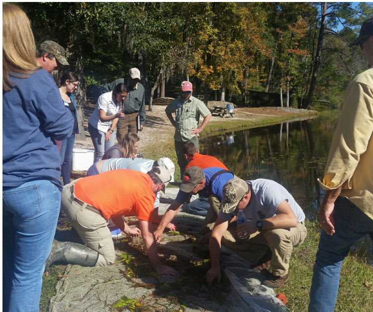
▲ Participants in the Master Pond Manager course used a seine net to assess the fish population in a recreational pond