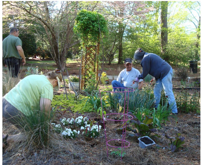
▲ The Sumter Master Gardeners work diligently to maintain gardens at Swan Lake Iris Gardens