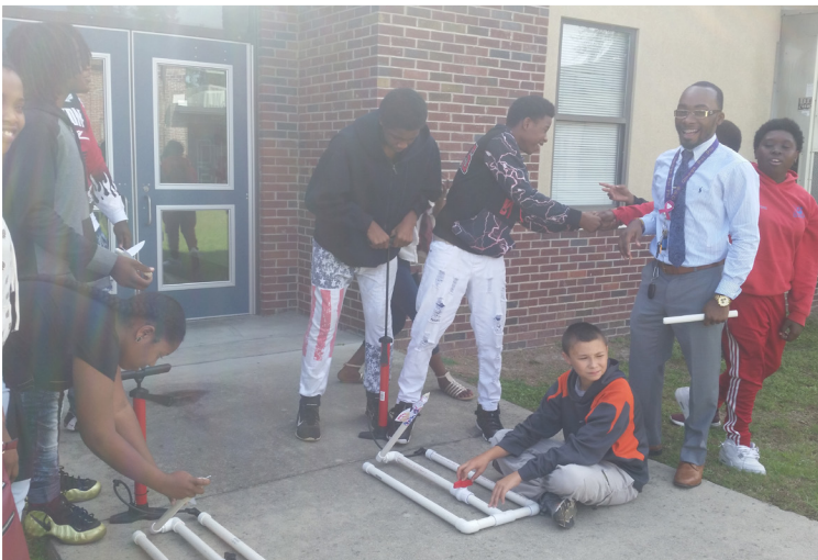
▲ Youth are engaged in launching paper rockets to see who how far and high the rockets will launch