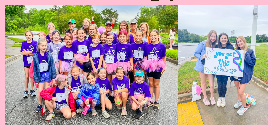
Girls on the Run

Gamma Phi Beta proudly supports Girls on the Run as our national philanthropic partner! GOTR is a non-profit organization that inspires young girls of all backgrounds to recognize and embrace their inner strength. This semester-long after school program teaches 3rd-5th graders valuable lessons about physical, mental, and emotional well-being and culminates in a 5K. Epsilon Theta loves working hands-on with the Liberty and Pickens Elementary School Program, where our sisters are coaches, running buddies, and role models.