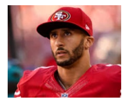
Colin Kaepernick Quarterback SF 49ers