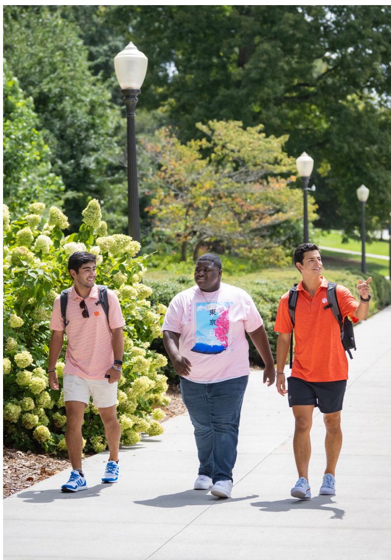
Clemson students enjoying a beautiful day on campus