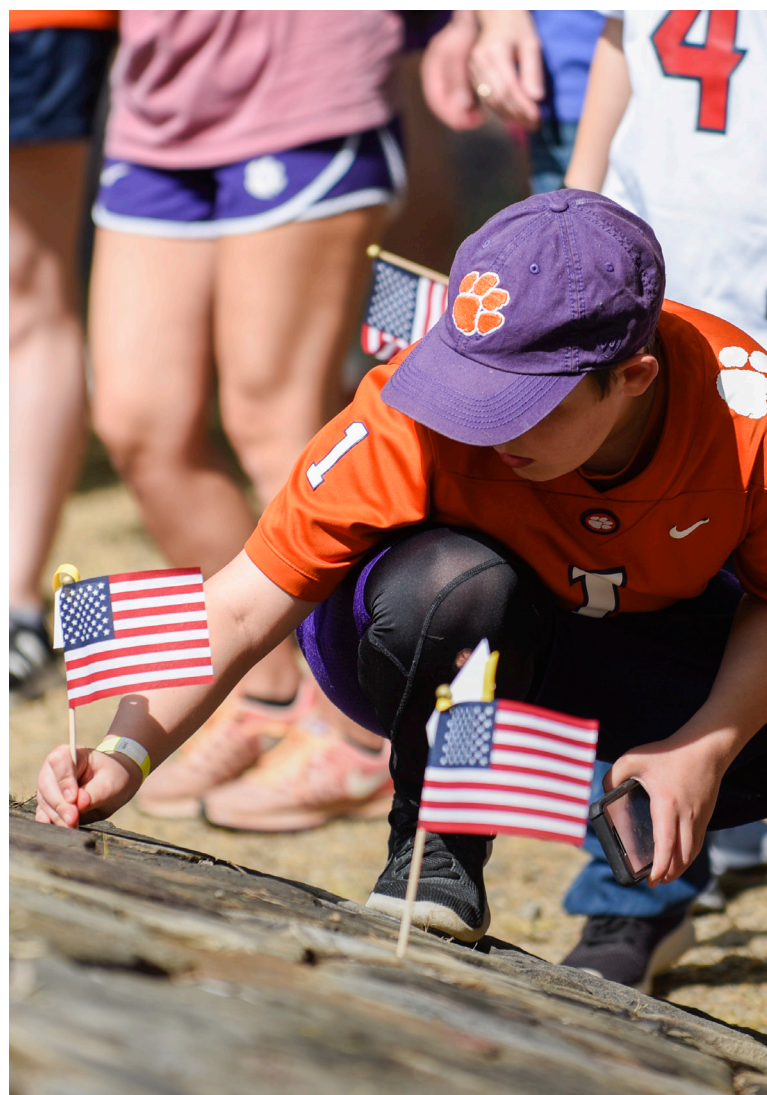
Walk for Veterans event attendee pays respects